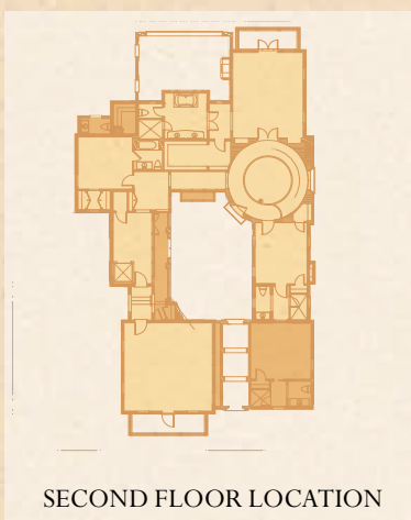
SECOND FLOOR LOCATION