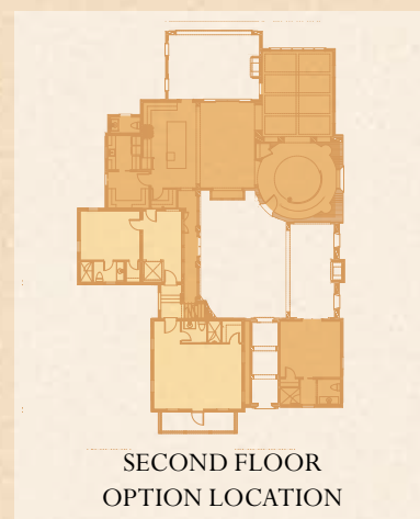
SECOND FLOOR OPTION LOCATION