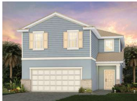
Elevation C (FM2C)