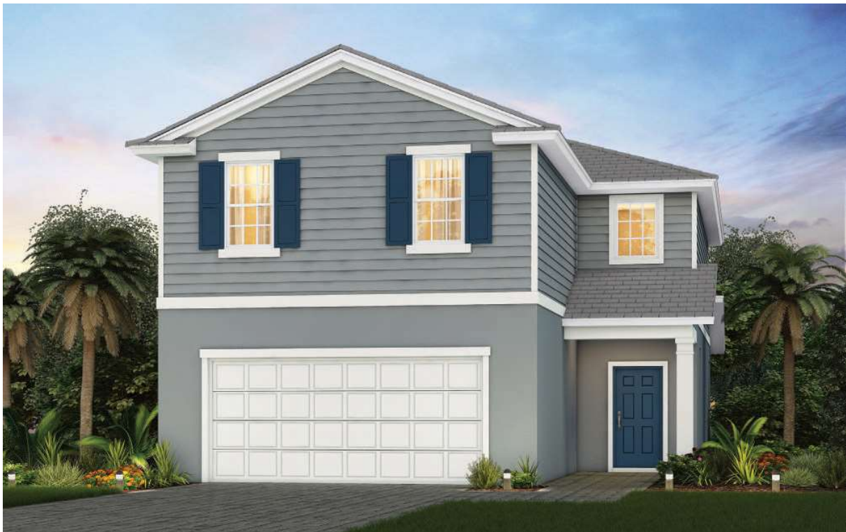
Elevation A (FM1A)

2,490 sq. ft. | 5 Bedrooms | 4 Bathrooms | 2-Car Garage | 40' Wide Home Site | 4 Bedrooms Upstairs Oversized Kitchen Island