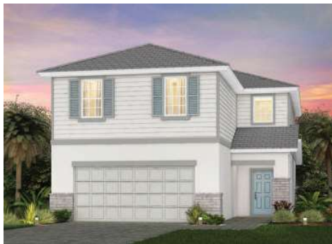
Elevation B (FM2A)